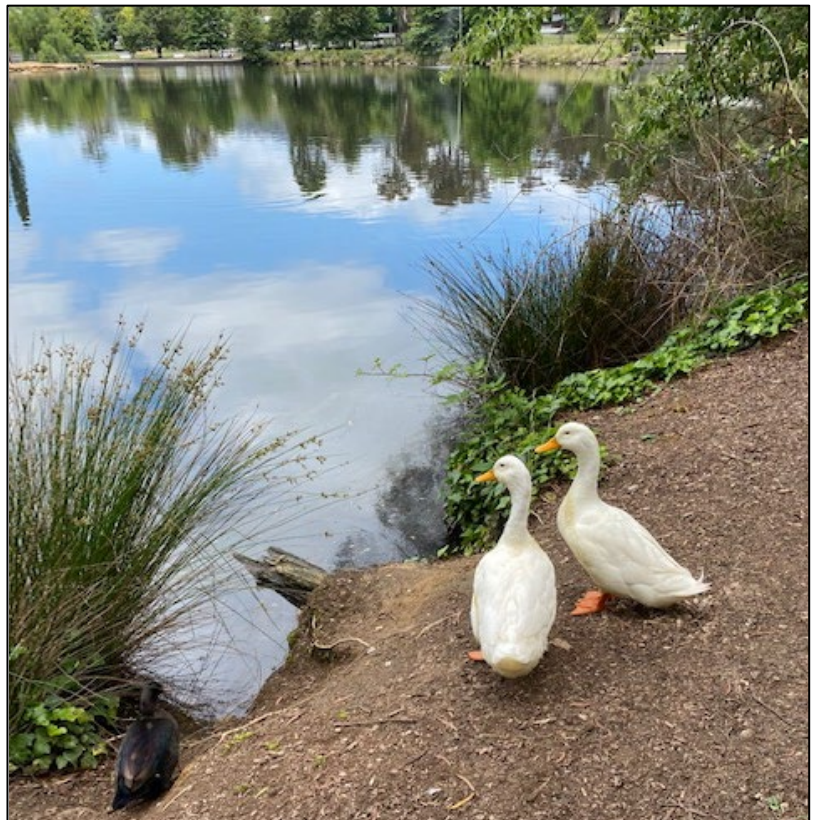
Pekin ducks: Not all residents have to be native!!