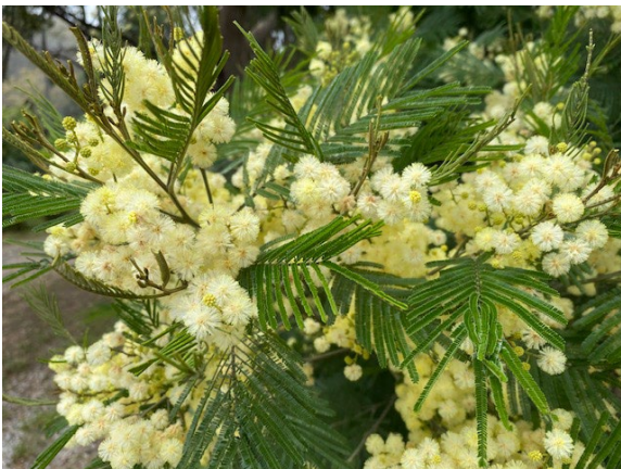
A young lace monitor