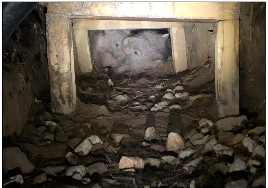
'Thank you but no thank you! It's just a bit too cold tonight.'

This beautiful property is a heart-warming example of pastoralists and wombats co-existing in perfect harmony!