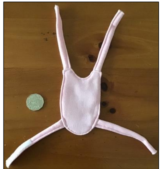
A 50c coin shows the size of the little coat

galah in Australian slang means a fool, as in 'You silly galah!'