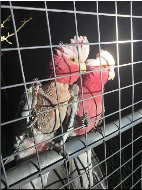
Isabella's featherless torso is clearly apparent in the above photo, taken at night, just after they were rehoused.