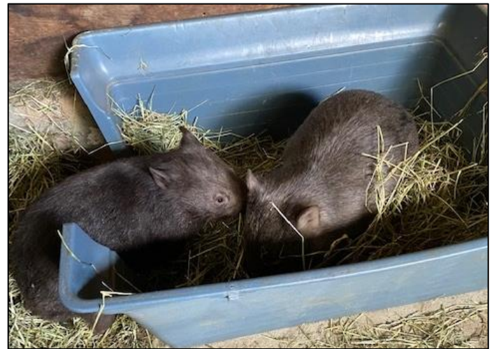
Above: Charlie and Ruben using the toilet in the stable sanctuary

Answer: Very clean. Unlike many animals, wombats have their own toilet areas and are fussy about cleanliness. They never poo in the burrow. Babies pop their bottoms out of the pouch as soon as they are old enough but prior to that, they clean their own pouch by consuming their own waste, dust and debris, thus acquiring essential gut flora. They also clean their own fingernails and those of their wisdom!