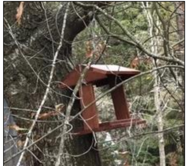
The food house is ready!