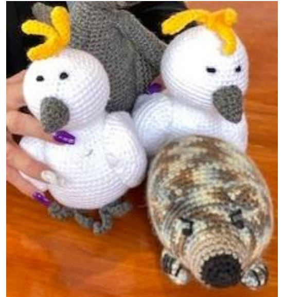
Unique hand crafted little wombats and cockatoos $15