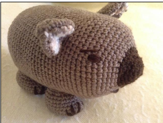
Wombatised fridge magnets and key rings $5