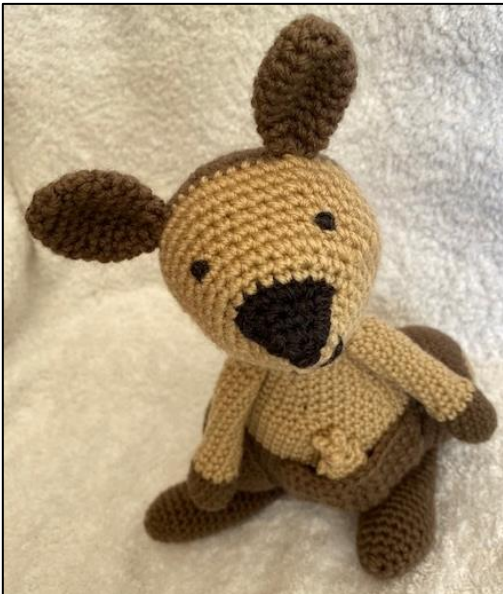
Adorable hand crafted kangaroos $20

when all our beautiful and unique merchandise would be on display for purchase.